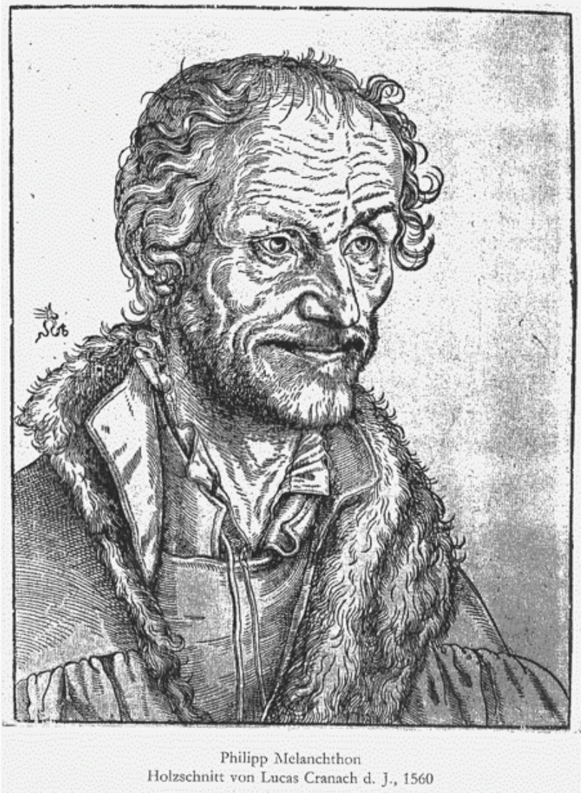
Woodcut of Melanchthon, 1560 by Lukas Cranach.